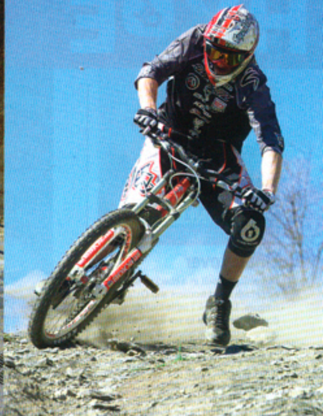
Peaty rips even when he's ill