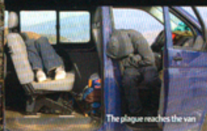
The plague reaches the van