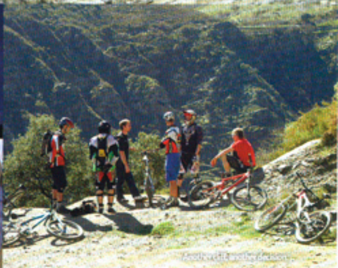
Good luck! It's not by accident