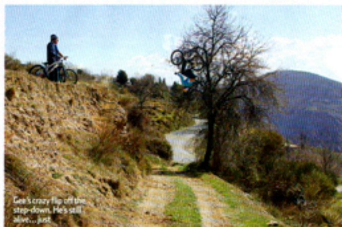
Gee's crazy flip off the step-down. He's still alive... just.